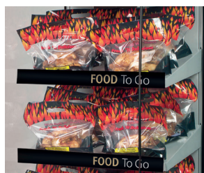
Price strips per shelf