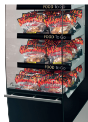
180-degree product view