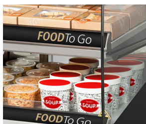
Optimum product visibility