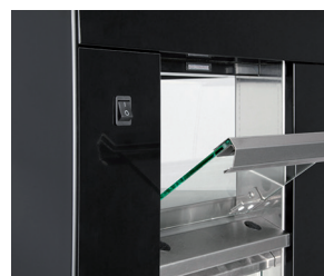
Rear doors (optional)