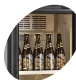
LED light inside door frame