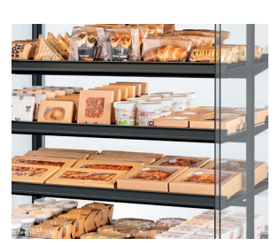
Ultimate product visibility - transparent design, thin shelves, no distraction.