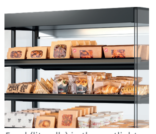
Food (literally) in the spotlights -LED lighting above each shelf.